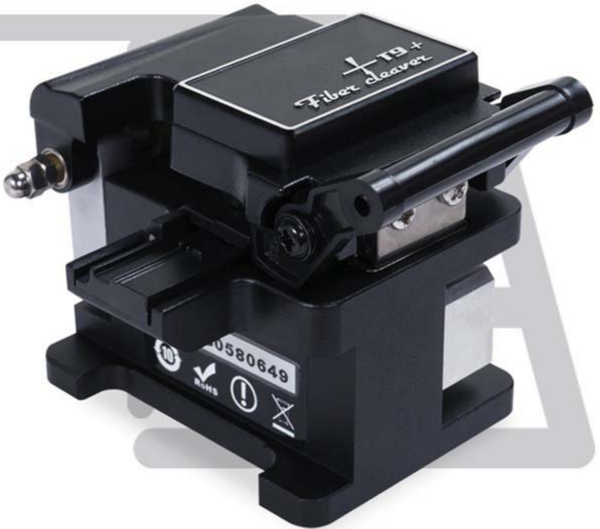
fiber cleaver T9+ Precision and durable