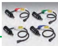
SLSI Series LED Spot Illumination