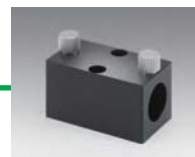
AD-0808 Light Guide Adapter