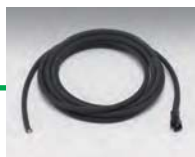
SLSI-EX Series External control cables for LED Spot Illumination Power Supply