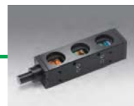
SLSI-RGBM RGB Color Mixing Unit