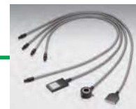
S1/S2シリーズ Light Guide for LED Spot Illumination