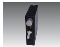
SPS-SLSI Power Supply for LED Spot Illumination