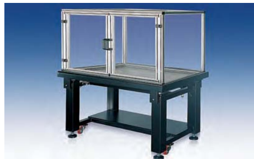
Clear Acrylic Enclosures