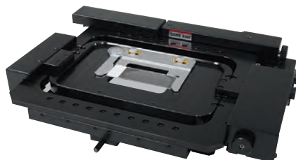
▲Thin long travel type