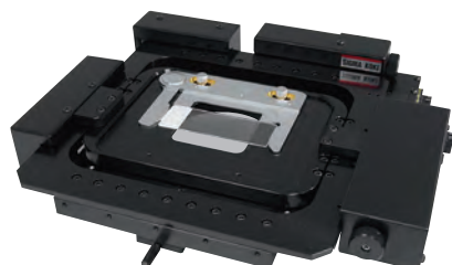
▲Thin standard type